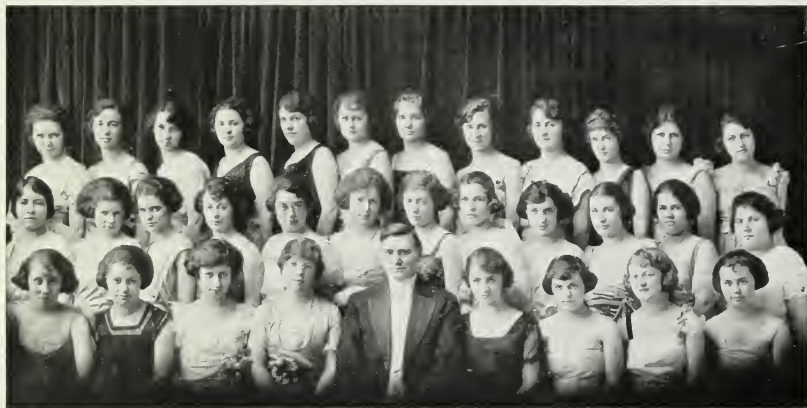
THE MADRIGAL CLUB